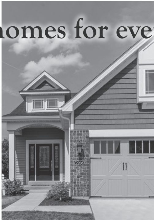
CAREFREE LIFESTYLE HOMES