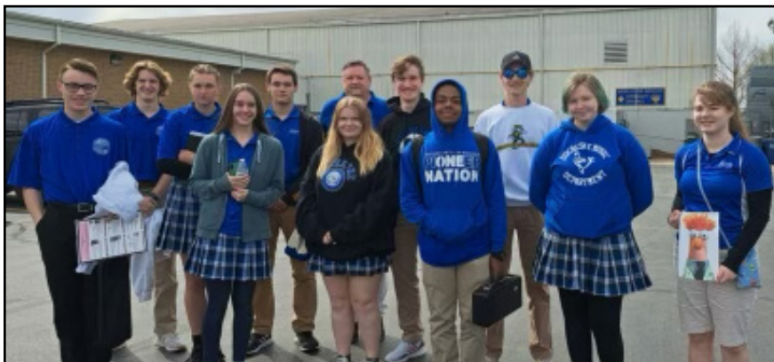
DHS band at the Missouri Small School Band Festival in Wright City. (above and below)