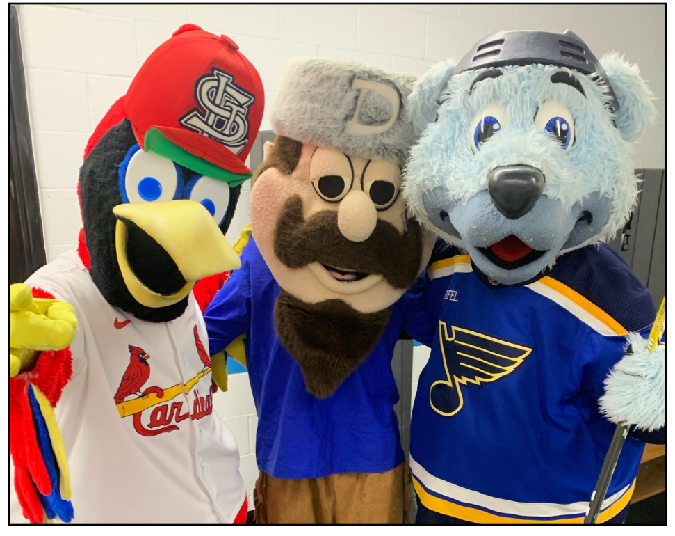
Pioneer Pete takes a quick time-out for a photo with Fredbird and Louie the Polar Bear.

Pioneer Pete represented DHS in the competition, and had the opportunity to rub elbows with the likes of Bushwhaker of the St. Louis Ambush, Fredbird of the St. Louis Cardinals, and Louie the Polar Bear of the St. Louis Blues.