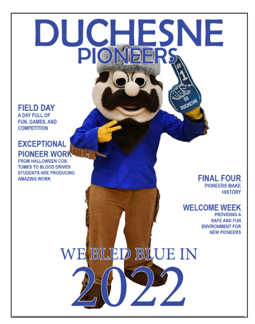
Click the image above and take a look!

Later this month, they have planned another visit to Incarnate Word Parish, All Saints, Assumption, St.Joseph's Cottleville and ICD. We are so proud of them! Keep up the good work!