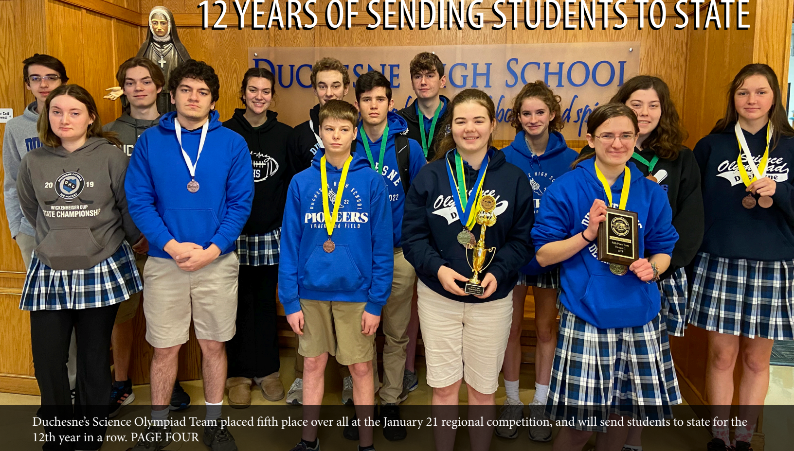
Duchesne's Science Olympiad Team placed fifth place over all at the January 21 regional competition, and will send students to state for the 12th year in a row. PAGE FOUR