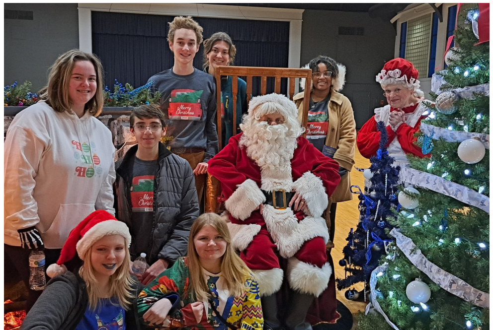
A few of Duchesne's choir members pose for a picture with Santa and Mrs. Claus

Huge THANK YOU to all of the students who helped set the scene, from our basketball guys filling sandbags to everyone working together to decorate, set up and clean