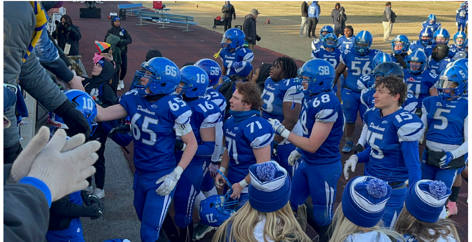
The Pioneers are embraced by the crowd after their 34-22 victory over Portageville.