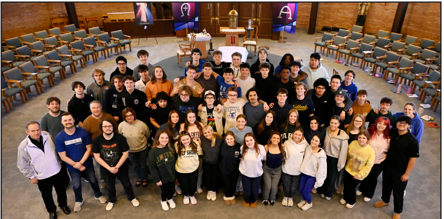
Duchesne's Class of 2026 experienced our first three-and-a-half day Kairos retreat off campus at the Pallottine Renewal Center.