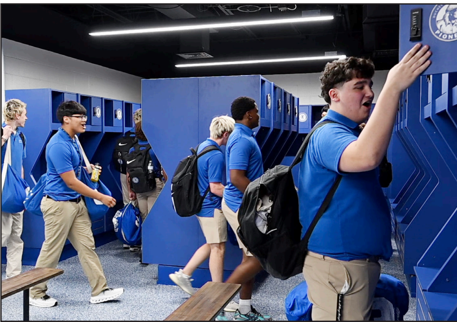
DHS students appreciate the complete renovation and upgrading of all five locker rooms on campus.