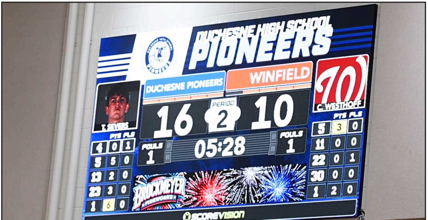
The new digital scoreboards in the gym help tell our story with exciting images in addition to showing the score and other game details.