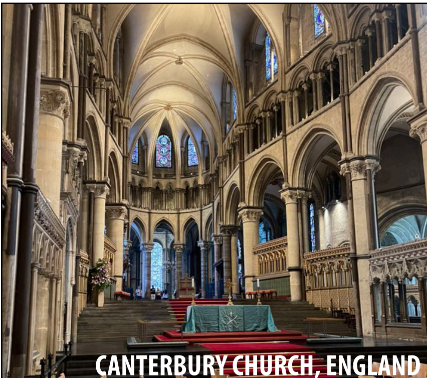
CANTERBURY CHURCH, ENGLAND