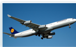
FAKE OR REAL