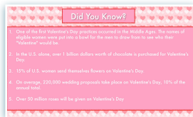
DID YOU KNOW