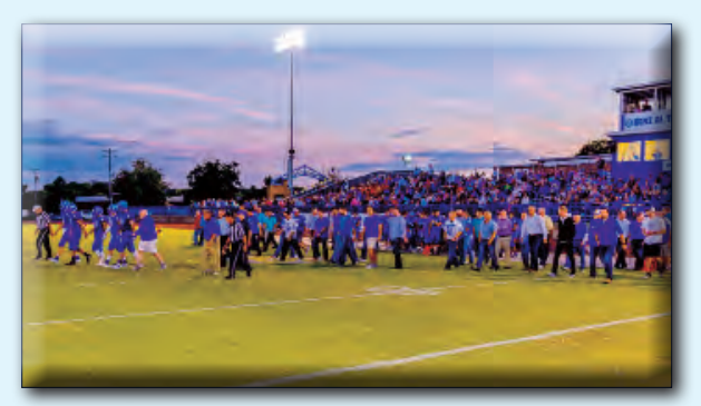
75 captains from teams past joined our current Pioneers for the coin toss.