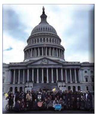
Duchesne was well represented a t t h e annual Pro Life march in Washington, D.C.