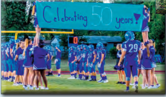
A welcome tunnel was ready for all the alumni captains.