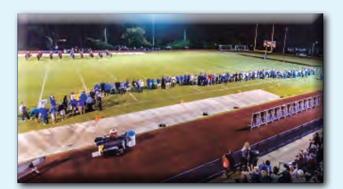
About 300 alumni football players were introduced by their senior football season years -- 50 classes.