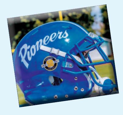
The 50 Years of Football Celebration was noted on the field as well as on special shirts and sweatshirts.