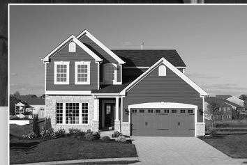
MIRALAGO St. Peters / Cottleville From $264,900