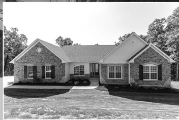
EHLMANN FARMS Weldon Spring From $479,900