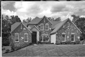
WYNDGATE OAKS O'Fallon Heritage From $409,900 Reserve From $599,900