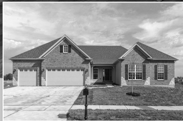
WILMER VALLEY Wentzville From $284,900

New homes in desirable locations, for every lifestyle, in all price ranges.