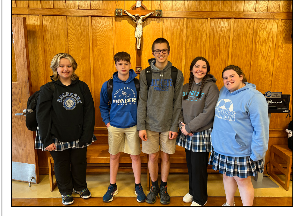
Shoutout to the DHS Bowling Team for placing 4th in their tournament on March 16 and earning scholarship money in the process!