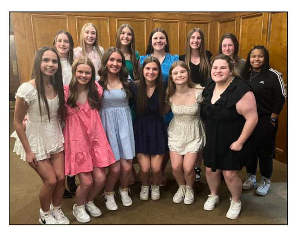
Our Girls Basketball Team had their end-of-year season banquet at Pios on March 19. They had a nice dinner and talked about each player about their contributions to the team. Congrats to these girls on a well-played season!