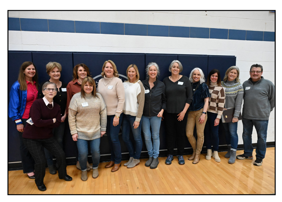
The 1984 Girls Track & Field State Championship Team

INFO UPDATES Alumni! Family! Friends! Help us