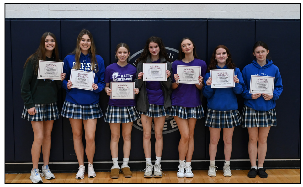
Duchesne's Missouri Volleyball Coaches Academic All-State representatives