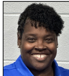
Paris Forest Head Girls Volleyball Coach

Catholic Education, and I have my master's degree in Theological Education. I have wanted to be an educator ever since I can remember, but it wasn't until high school that I truly decided that I wanted to pursue a career in theology. I am excited to live out my vocation at Duchesne and to help the students discover a